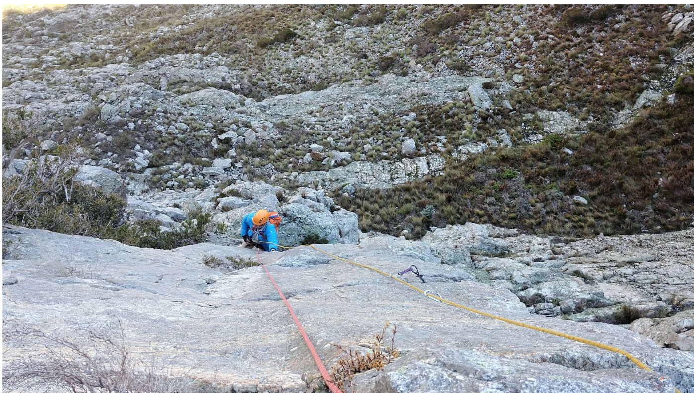
Snort following pitch 2 on Terrific Time.